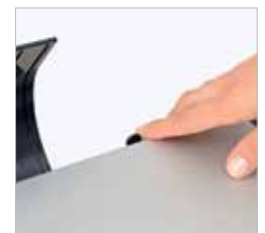
Paper pressure adjustment slider allows you to keep scanning whatever the document.