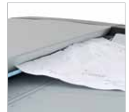
Fail-proof funnel-shaped paper for ease of paper insertion.