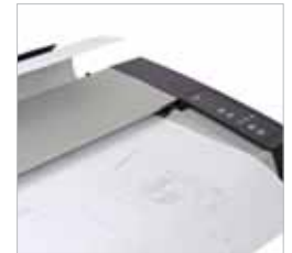
Intelligent paper return does away with paper rewinding.